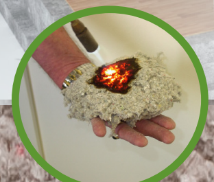
Increased Fire Resistance