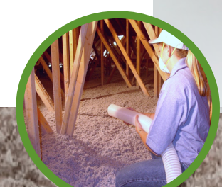
Easy & Safe to install