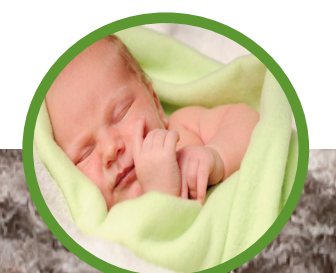
Superior thermal and acoustical properties - comfort

Weathershield provides seamless coverage